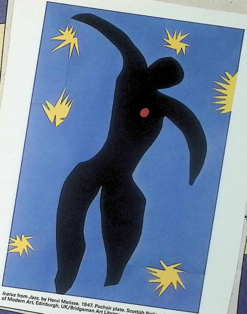
Icarus from Jazz, by Henri Matisse. 1947. Pochoir plate.