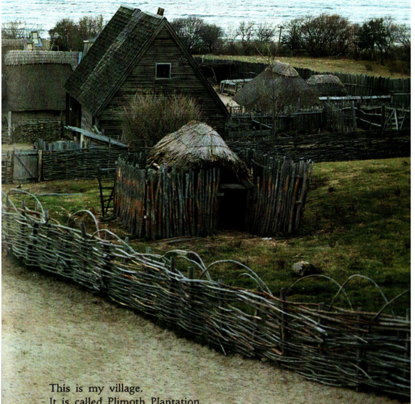
This is my village. It is called Plimoth Plantation.