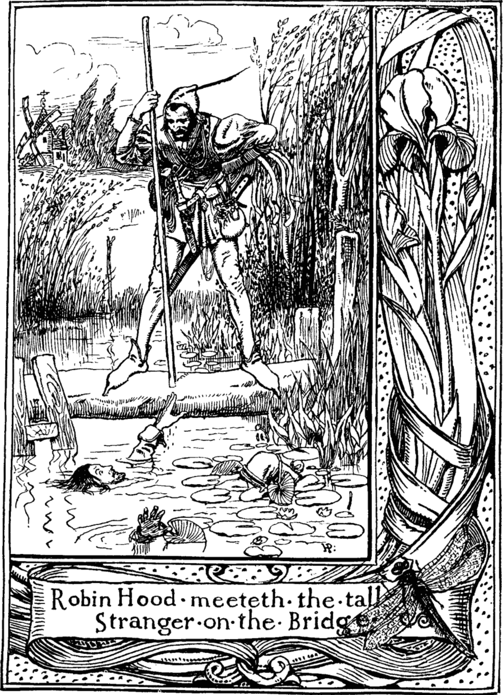
Robin Hood · meeteth · the · tall Stranger · on · the · Bridge