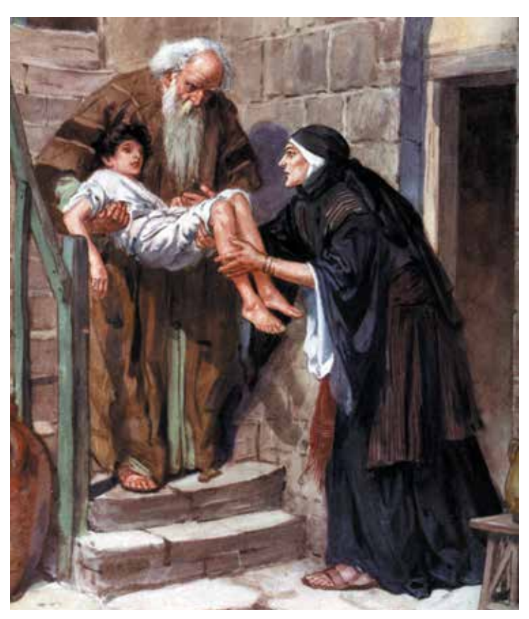
The Shunammite Woman's Son is Healed