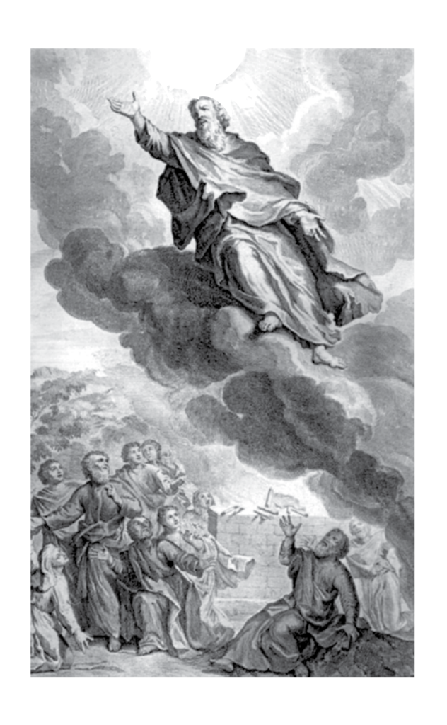
Enoch and Methuselah Genesis 5:21–32