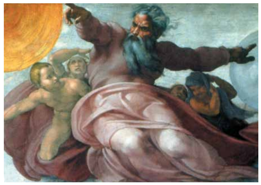
Creation of the Sun and Moon Sistine Chapel Ceiling