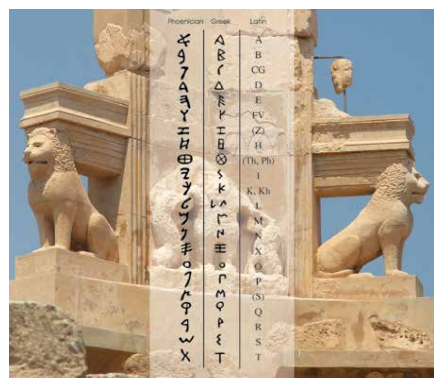
Phoenician Temple and Alphabet Charts